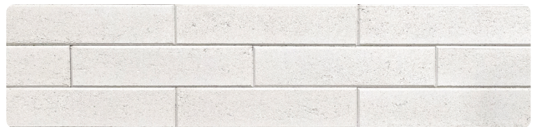
FINLAND | SPECIAL ORDER!

Looking for a mortared look? Maxum can be installed with a traditional mortared format. We recommend you reach out to your local technical representative for details.