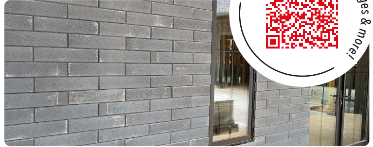
SET IN BRICK » COAL | Maxum Dry-Stack

*Use one clip per brick for walls under 30 feet high and two clips per brick for walls 30 feet and taller.